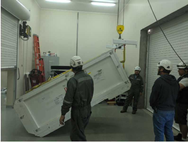
Lowering the electronics box.