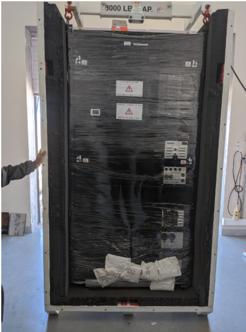
The electronics box rack in the shipping box.

NOTE: Leave the rack attached to and supported by the crane until the lid (currently a side) is installed. This is to prevent the rack from tipping out of the box.