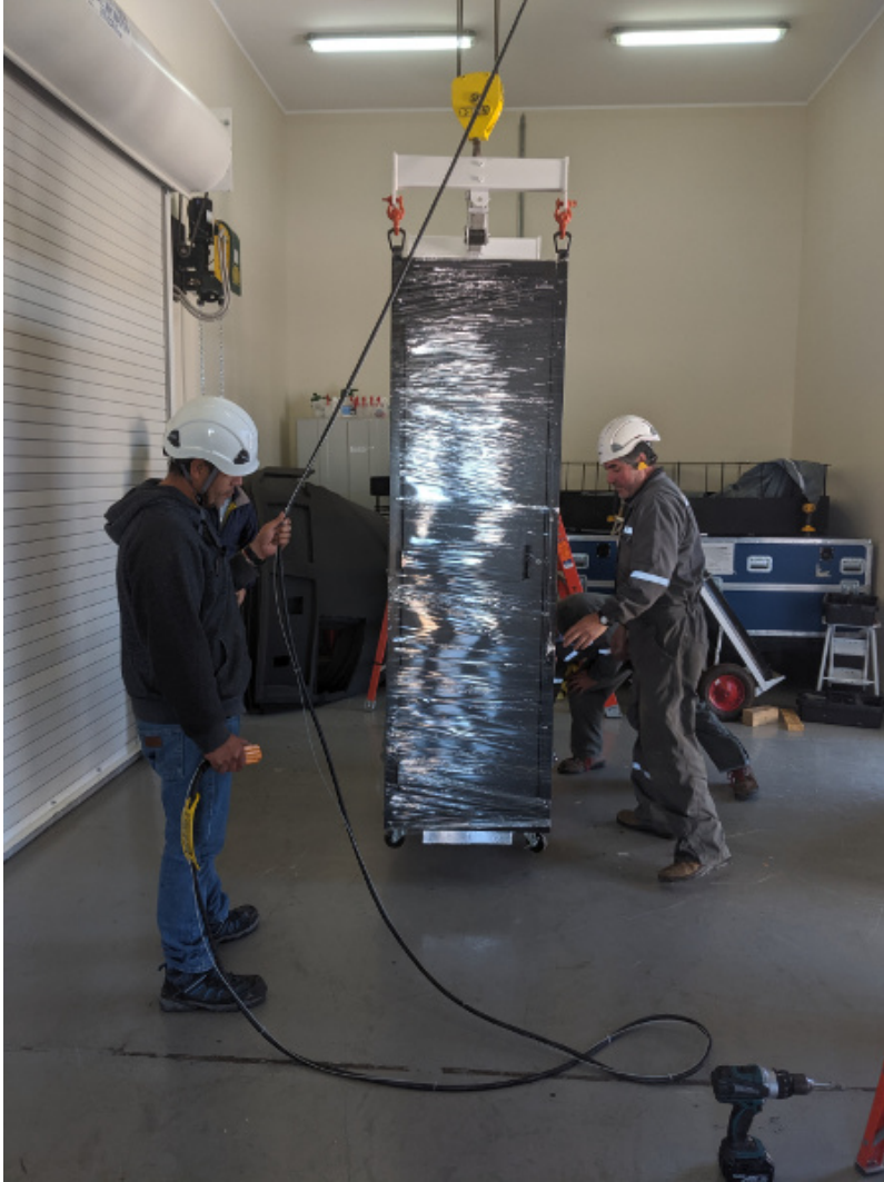
The electronics box rack being lifted.