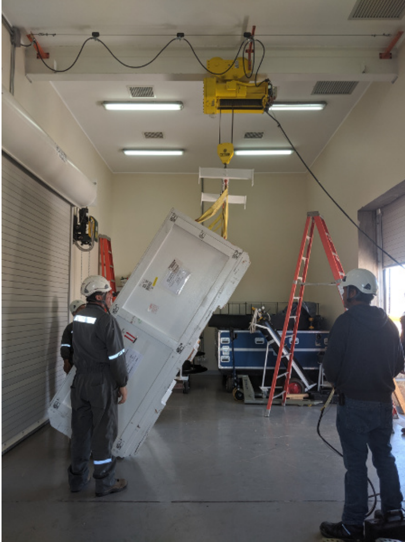
The electronic box being lifted into loading position