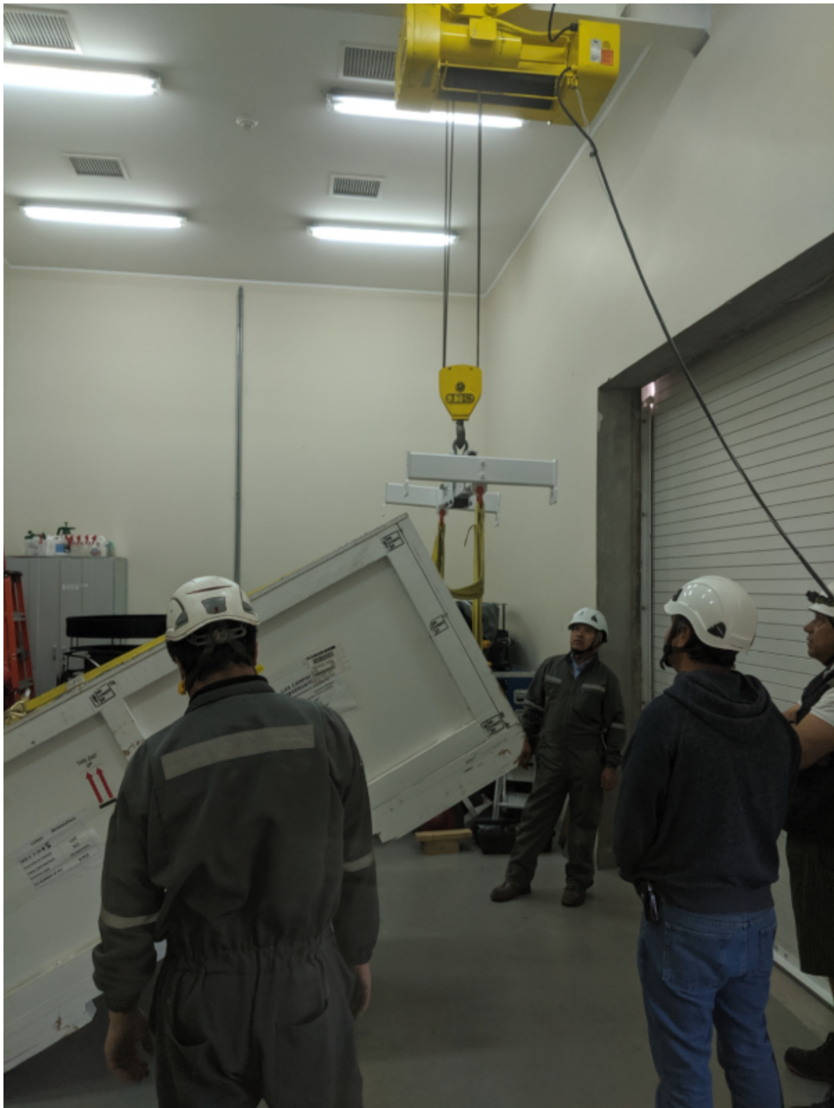
The electronics box being lifted. Note that as it is lifted the crane truck moves to the left.