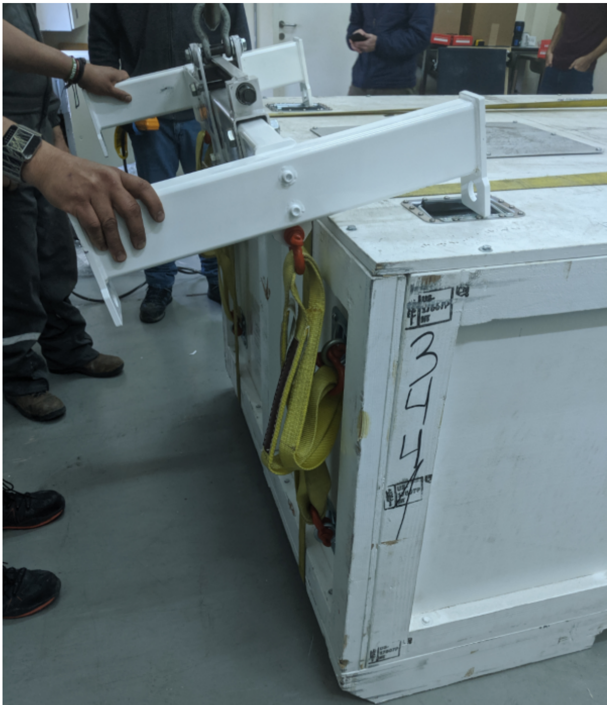
Lifting fixture rigged to box lid.