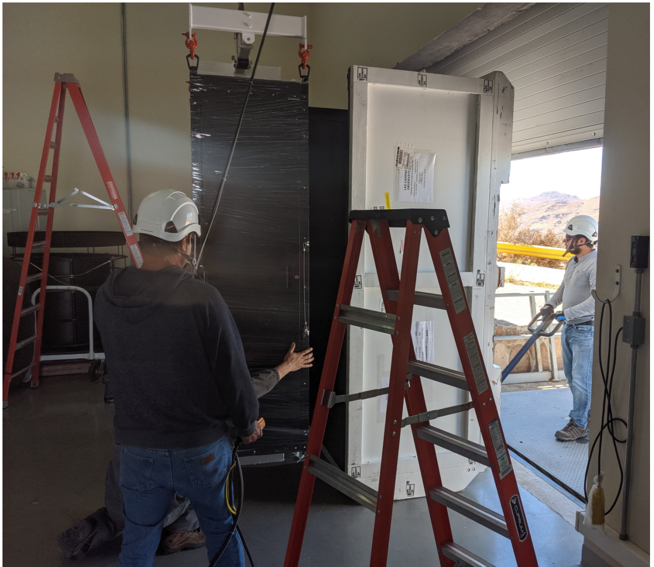
The rack being removed from the box.