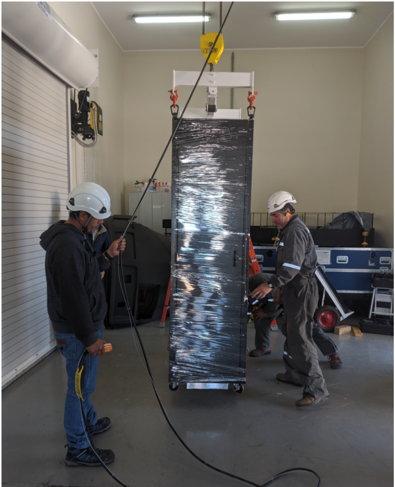
Setting the Rack down.