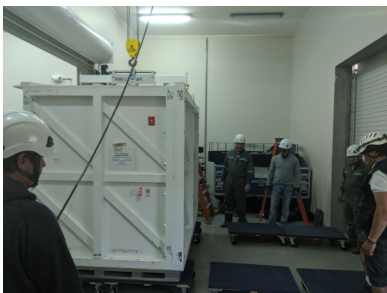
Ready to lift the lid