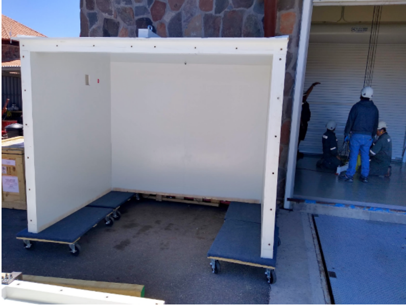
The lid stored outside