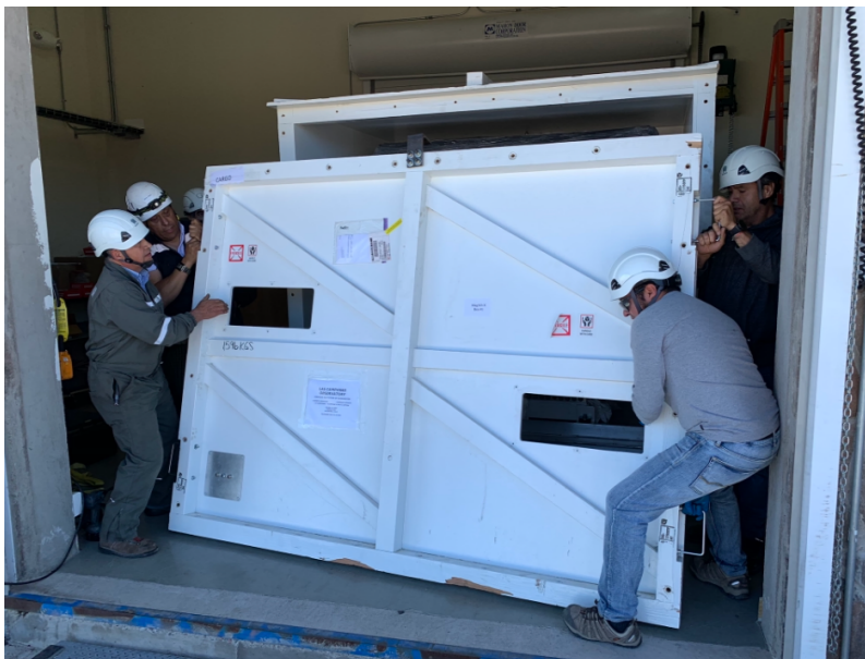
Removal of the front panel