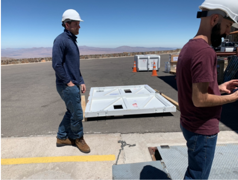
The front panel temporarily stored outside