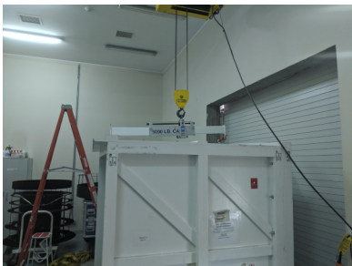
The lifting fixture attached to the lid