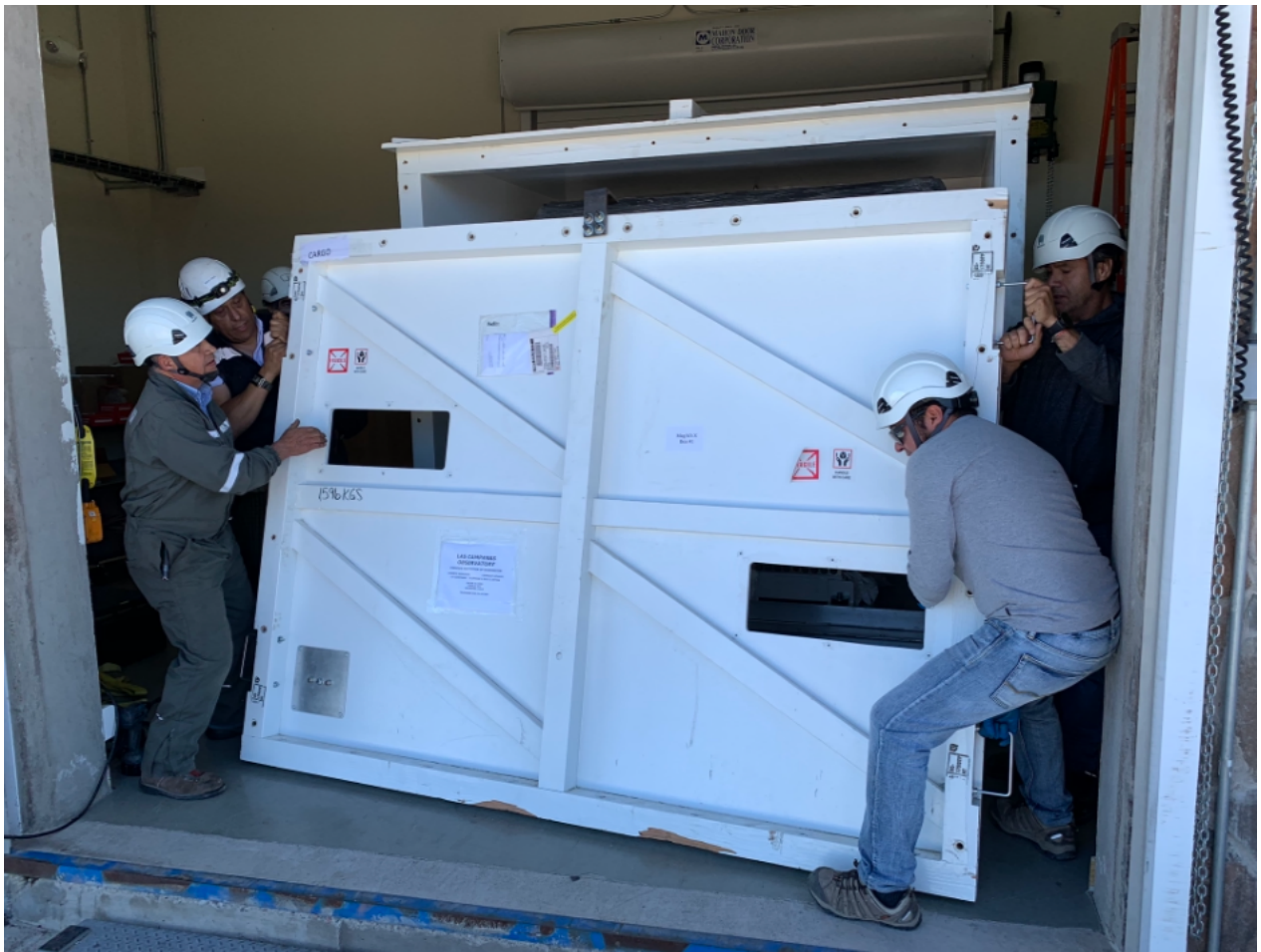
Removal of the front panel