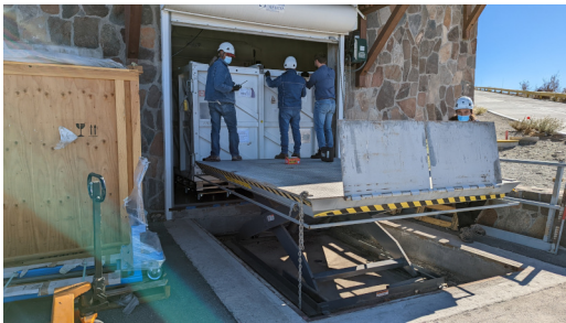
Using the pentalift to access the upper bolts on the door