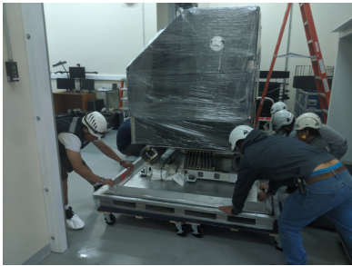
Moving the instrument on the pallet into the cleanroom temporarily