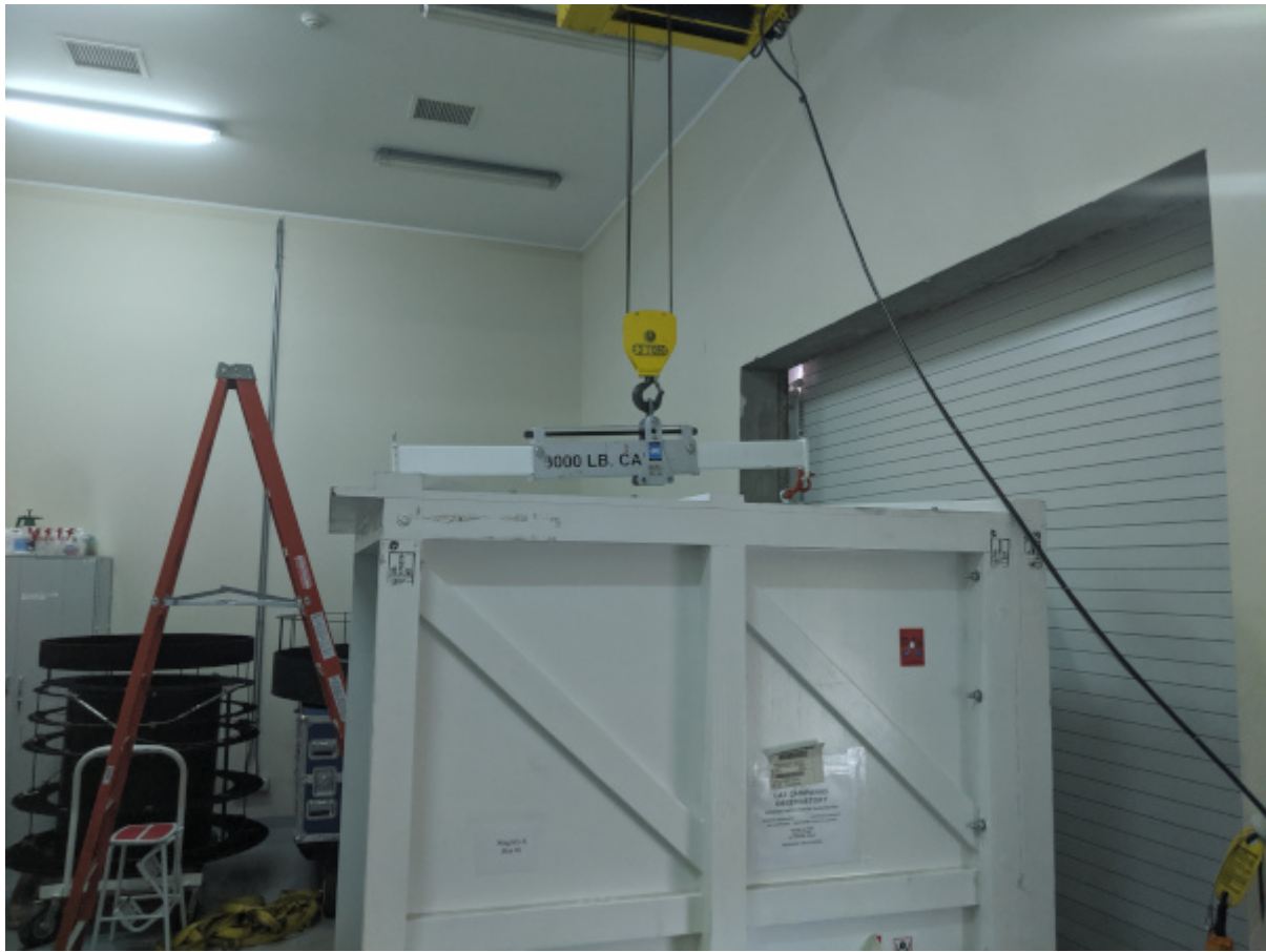
The lifting fixture attached to the lid