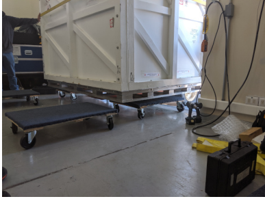
Using the forklift to set the box down on 4 furniture dollies