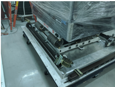
The cart is assembled on the pallet around the instrument. This shows it in progress.

NOTE: The cart parts are labeled with A B C D, and they should be oriented to match the table.