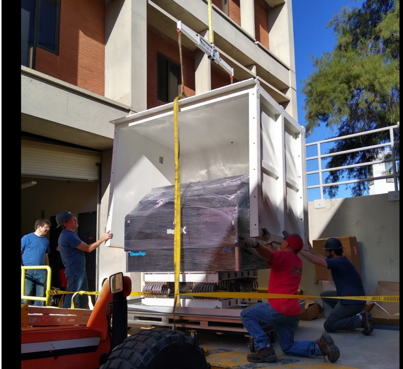
Lifting the lid. Note it does not need to go this high at LCO